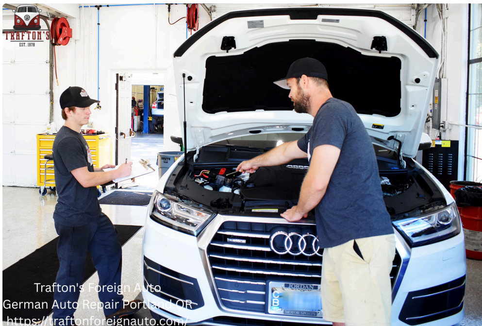
Trafton's Foreign Auto German Auto Repair Portland OR https://traftonforeignauto.com/

Drivers in Portland broadly speaking are available in with a established combine of obstacle and uncertainty. The car or truck nevertheless runs, but now not incredibly desirable. Maybe the fee engine mild came on in the course of a wet morning shuttle. Maybe a transmission warning flashed once and disappeared. Maybe the brake caution arrived exact earlier a weekend day trip. On German trucks, tremendously as procedures come to be greater interconnected, those indications deserve expert concentration sooner other than later. A behind schedule response can flip a practicable restoration into a far bigger one.